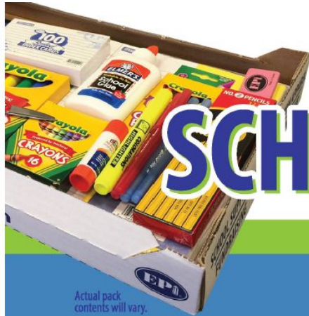
Actual pack contents will vary.