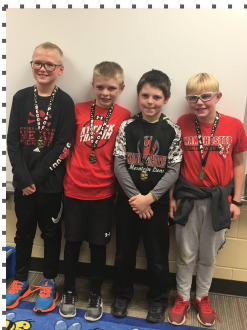
2nd Place at Districts