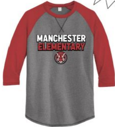
F ¾ Vintage Tee *Adult sizes only