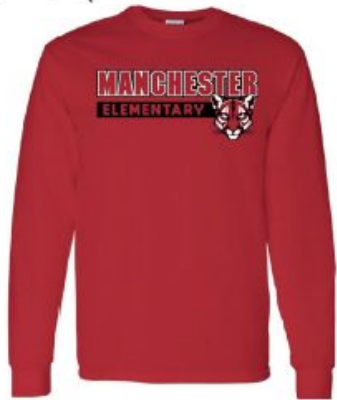
D Long-Sleeve T-Shirt